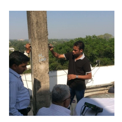
CONCRETE COLUMN TESTING