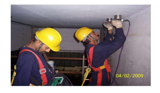
SURFACE PROBING OF ROOF SLAB