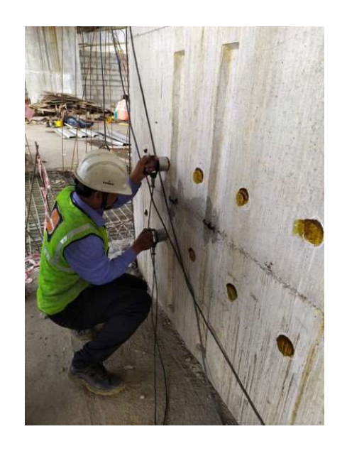
SURFACE PROBING OF CONCRETE WALL

A range of Transducer pairs ranging from 24KHz up to 500KHz are available for the user to choose depending on the application at hand.