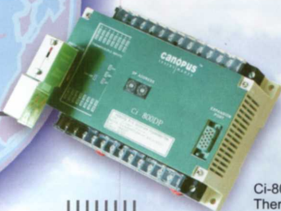
Ci-800DP Remote Thermocouple Cluster Transmitter