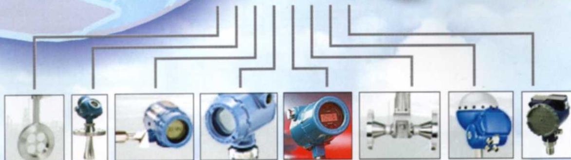
Analog Process Transmitters