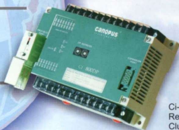
Ci-800DP Remote Process Cluster Transmitter